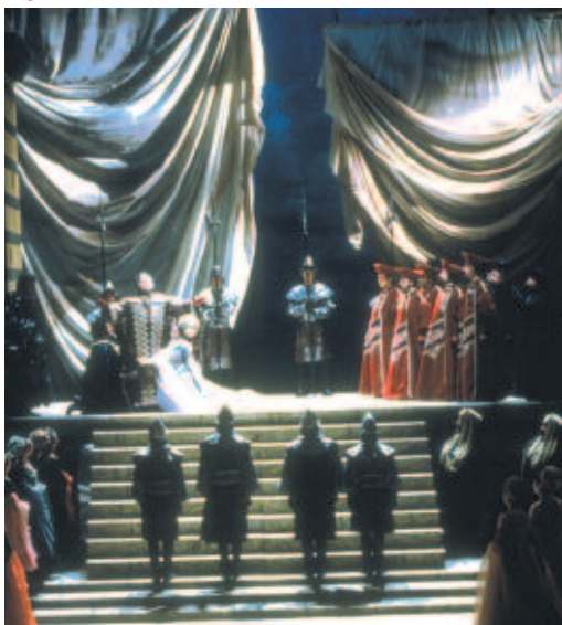
Bocca Negra - Royal Opera of Wallonie