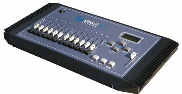
91713 301 Back up console