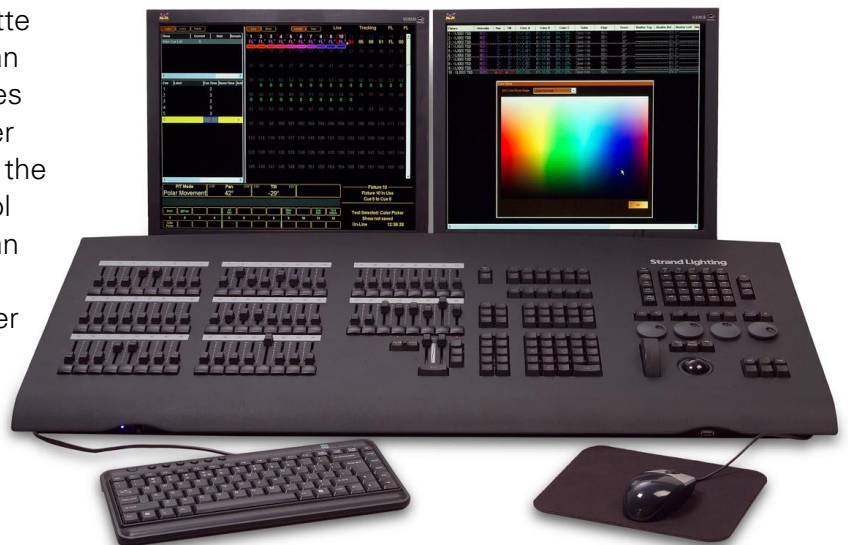
92814 Palette VL, 64 submaster console

There's so much that's new with Palette VL. And so much that you already know. The Palette VL family of consoles bridge between the clean simple operation of our regular Palette consoles with the control and sophistication of our larger Light Palette VL consoles. Now you can have the power of conventional and moving light control in a value priced system. Palette VL features an integral trackball, moving light encoders and direct action attribute keys to extend the power of the Palette family of consoles. Available with 500 to 1500 channels, the new consoles now offer an optional second video display to present more information to console operators, including an advanced moving light control screen.