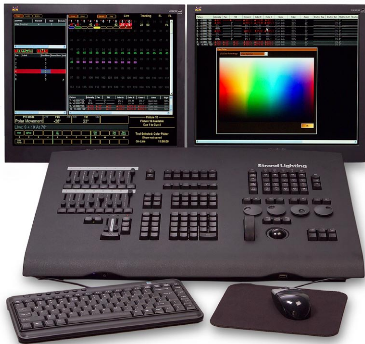
92811 Palette VL, 16 submaster console

Oh, and you can even read your existing Strand 300 and 500 series console show files, bringing new life to your repertory of productions.