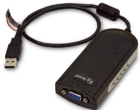
A second video display is available using our new plug in USB video module.