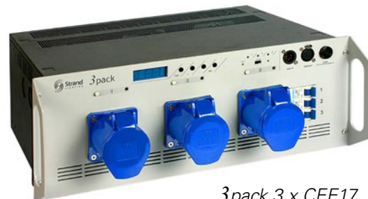
3pack 3 x CEE17 code 75300