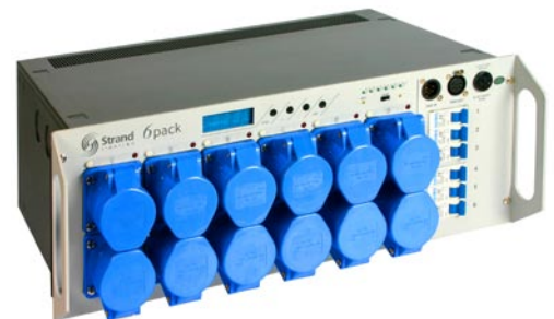
6pack Dual 16A code 75304