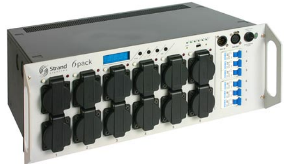
6pack Dual Schuko code 75303

6pack and 3pack are ideal for rental, educational drama spaces, and just about any place where accurate, reliable dimming is needed in a small space – and on a small budget.