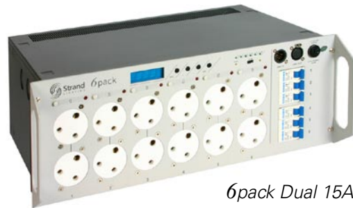
6pack Dual 15A code 75302